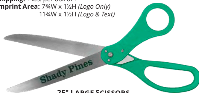
25" LARGE SCISSORS

Imprint Area: 7¾W x 1½H (Logo Only) 11¾W x 1½H (Logo & Text)